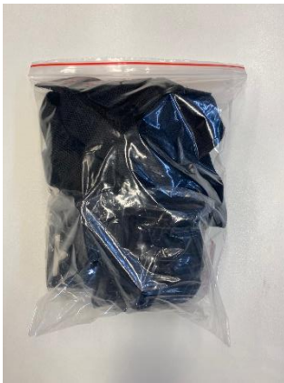
A. Strap Kit (Consists of 6x straps)