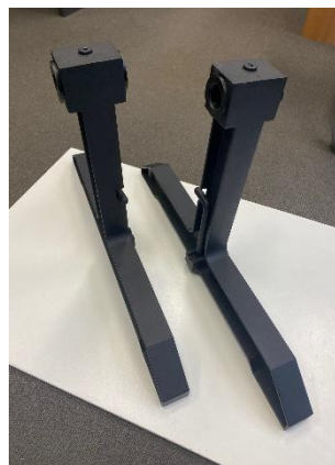
F. 2x Roller Ends