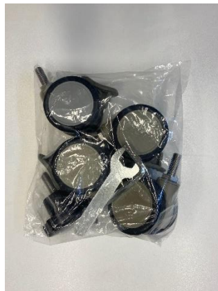
B. 4x Lockable Caster Wheels.