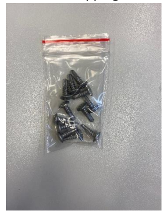
D. 12x Self tapping screws