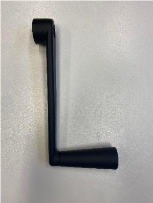
E. Roller Handle