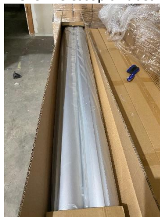
G. 3x Telescopic Tubes