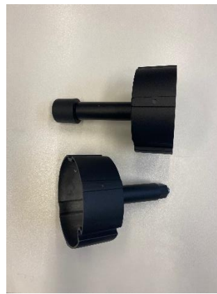
C. 2x Tube Ends