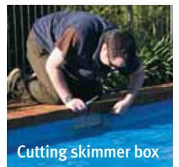
Cutting skimmer box